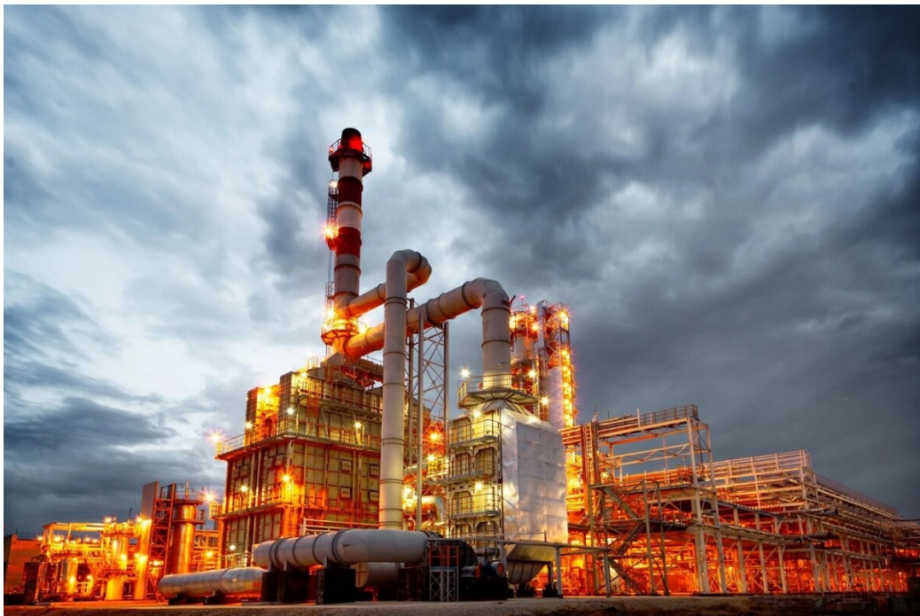
Industrial-scale construction — built to international standards